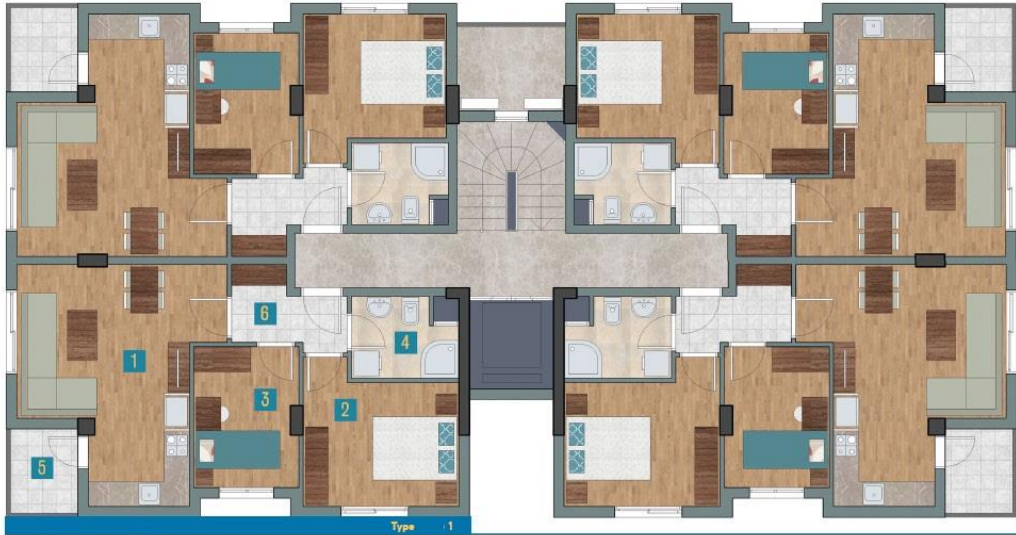
Middle Floor Plan